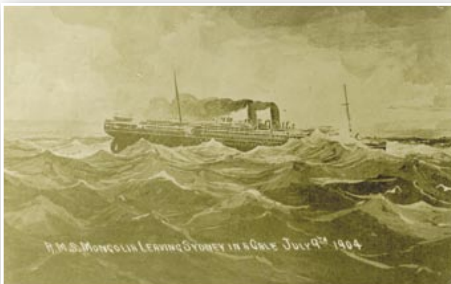
R.M.S. Mongolia leaving Sydney in a gale July 9th 1904